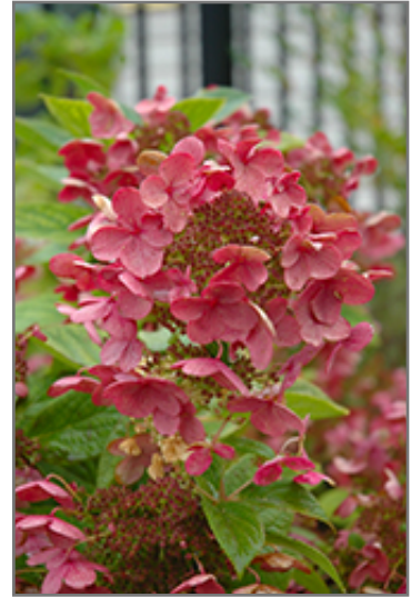
Quick Fire Hydrangea flowers (faded)

This shrub performs well in both full sun and full shade. It prefers to grow in average to moist conditions, and shouldn't be allowed to dry out. It is not particular as to soil type or pH. It is highly tolerant of urban pollution and will even thrive in inner city environments. Consider applying a thick mulch around the root zone in winter to protect it in exposed locations or colder microclimates. This is a selected variety of a species not originally from North America.