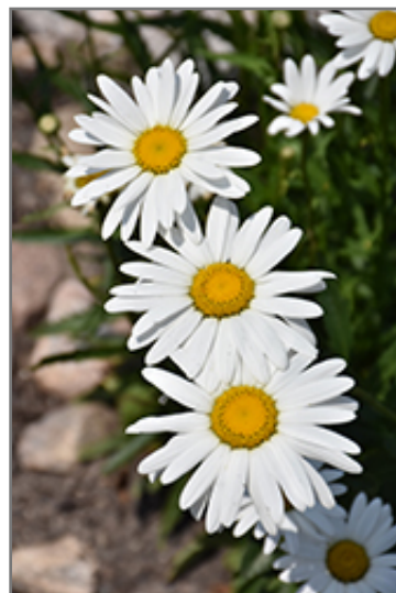
Silver Princess Shasta Daisy flowers