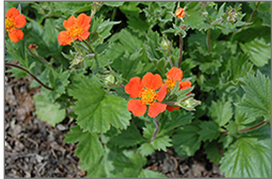
Boris Avens flowers

Boris Avens is recommended for the following landscape applications;