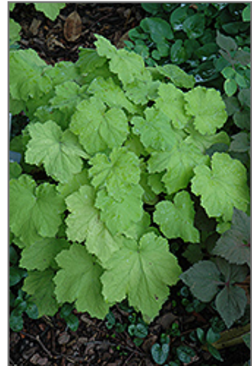
Pistache Coral Bells