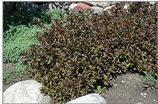
Dark Horse Weigela