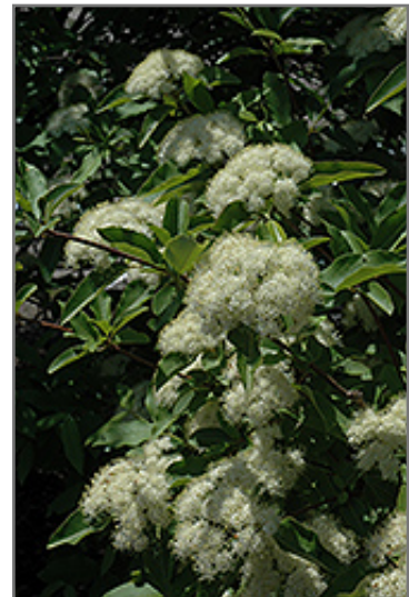
Witherod Viburnum flowers