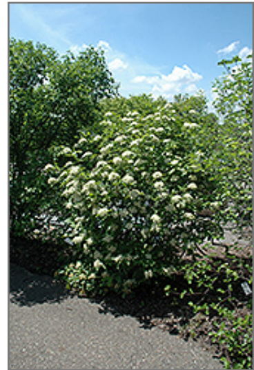
Witherod Viburnum in bloom