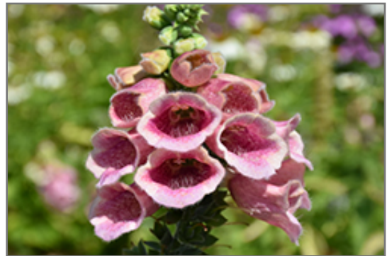
Strawberry Foxglove flowers