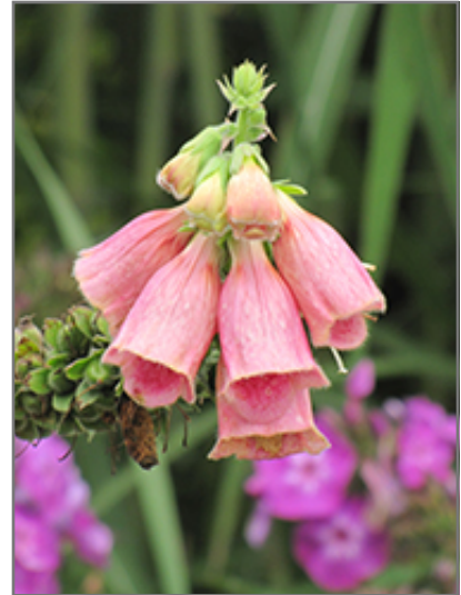
Strawberry Foxglove flowers

Strawberry Foxglove is recommended for the following landscape applications;