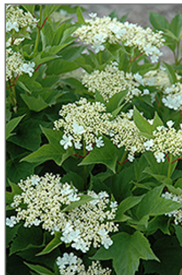
Alfredo Highbush Cranberry flowers

Alfredo Highbush Cranberry is recommended for the following landscape applications;