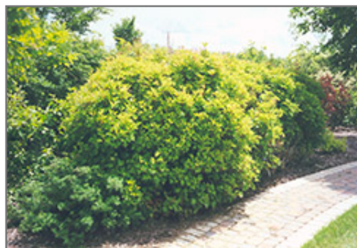
Alfredo Highbush Cranberry