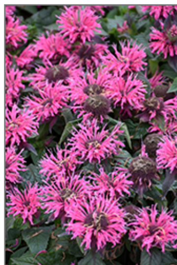
Sugar Buzz Bubblegum Blast Beebalm flowers