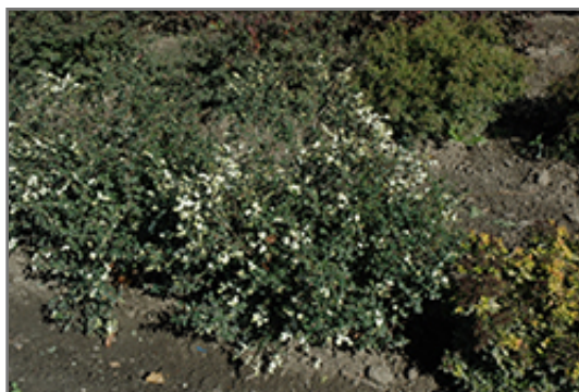
Galaxy Coralberry