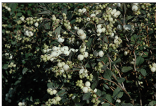
Galaxy Coralberry fruit

Galaxy Coralberry is recommended for the following landscape applications;