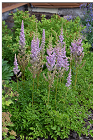
Dwarf Chinese Astilbe 'Pumila' in bloom