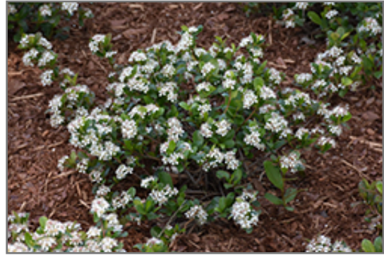
Low Scape Mound Aronia in bloom