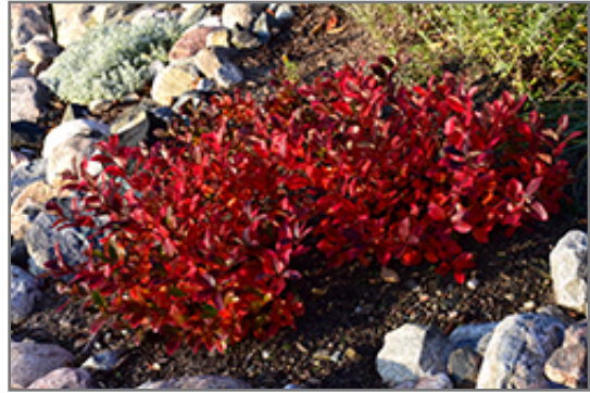
Low Scape Mound Aronia in fall

Low Scape Mound Aronia will grow to be about 24 inches tall at maturity, with a spread of 24 inches. When grown in masses or used as a bedding plant, individual plants should be spaced approximately 18 inches apart. It tends to fill out right to the ground and therefore doesn't necessarily require facer plants in front. It grows at a slow rate, and under ideal conditions can be expected to live for approximately 20 years.