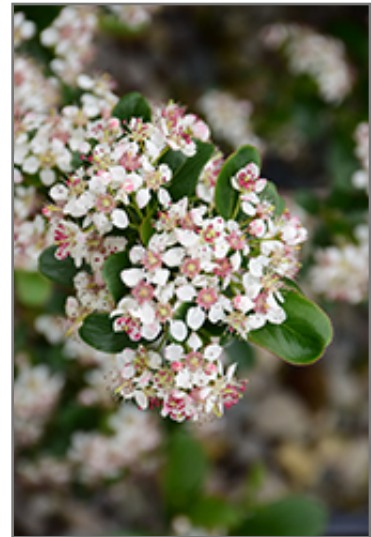
Low Scape Mound Aronia flowers