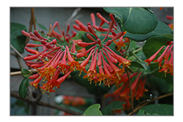
Dropmore Scarlet Trumpet Honeysuckle flowers