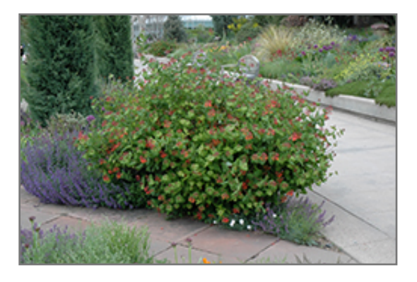
Dropmore Scarlet Trumpet Honeysuckle in bloom