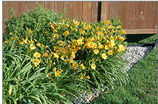
Stella de Oro Daylily in bloom