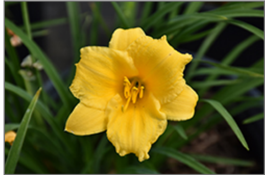
Stella de Oro Daylily flowers