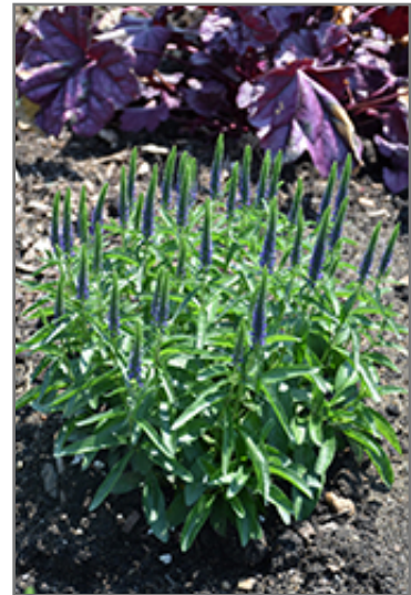
Magic Show Wizard of Ahhs Speedwell in bloom

Have your garden come alive and buzzing with activity with these pollinator friendly plant options. Look for plants tagged with this promotion title: "Pollinator Friendly Plants" to add to your garden. You can also look for pollinator plants by scrolling to the bottom of each plant page and looking for the "butterfly" symbol. Click "Learn more about this promotion!" for more inspiration from one of our vendors, Monrovia.