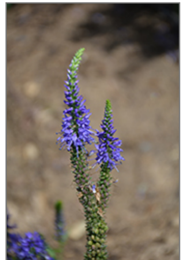
Magic Show Wizard of Ahhs Speedwell flowers