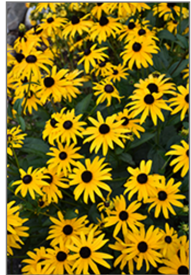
American Gold Rush Black Eyed Susan flowers

This is a relatively low maintenance plant, and should be cut back in late fall in preparation for winter. It is a good choice for attracting birds, bees and butterflies to your yard, but is not particularly attractive to deer who tend to leave it alone in favor of tastier treats. It has no significant negative characteristics.