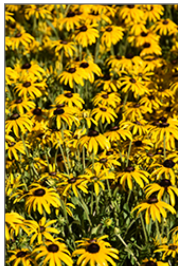
American Gold Rush Black Eyed Susan flowers

Have your garden come alive and buzzing with activity with these pollinator friendly plant options. Look for plants tagged with this promotion title: "Pollinator Friendly Plants" to add to your garden. You can also look for pollinator plants by scrolling to the bottom of each plant page and looking for the "butterfly" symbol. Click "Learn more about this promotion!" for more inspiration from one of our vendors, Monrovia.