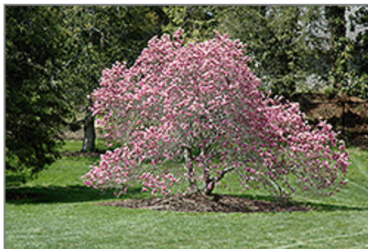
Ann Magnolia in bloom