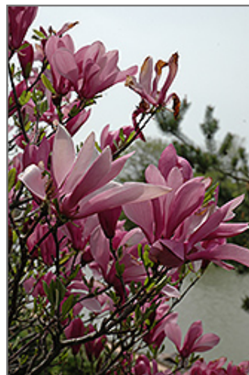
Ann Magnolia flowers