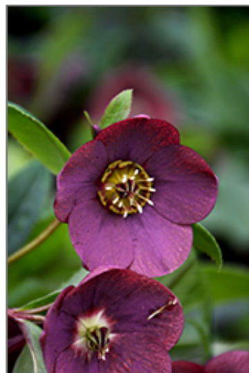
Honeymoon Rome In Red Hellebore flowers

Honeymoon Rome In Red Hellebore is recommended for the following landscape applications;