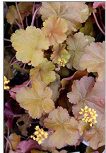
Sirens' Song Orange Delight Coral Bells foliage