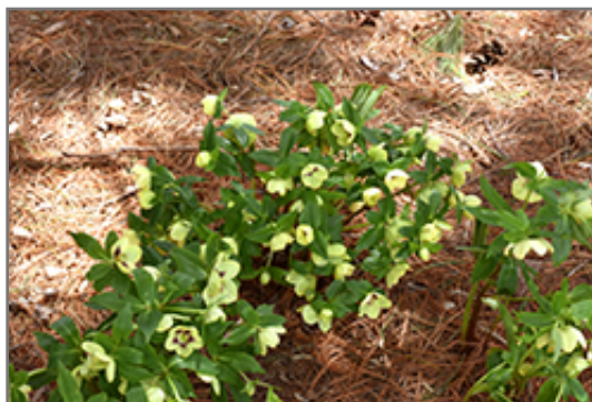
Honeymoon Spanish Flare Hellebore in bloom