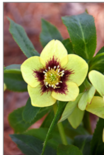
Honeymoon Spanish Flare Hellebore flowers

Honeymoon Spanish Flare Hellebore is recommended for the following landscape applications;