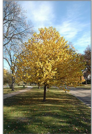
Amur Cherry in fall

This tree should only be grown in full sunlight. It does best in average to evenly moist conditions, but will not tolerate standing water. It is not particular as to soil type or pH. It is somewhat tolerant of urban pollution. This species is not originally from North America.