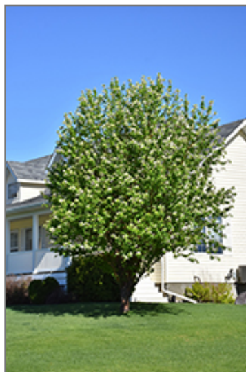
Amur Cherry