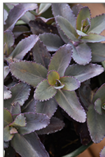
Evolution Chocolate Fountain Stonecrop foliage