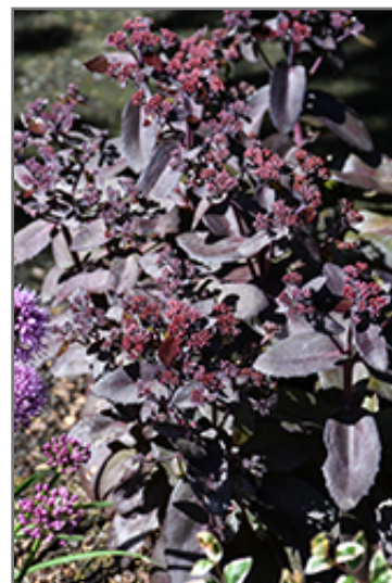
Evolution Chocolate Fountain Stonecrop flowers

Evolution Chocolate Fountain Stonecrop is a dense herbaceous perennial with an upright spreading habit of growth. Its relatively coarse texture can be used to stand it apart from other garden plants with finer foliage.