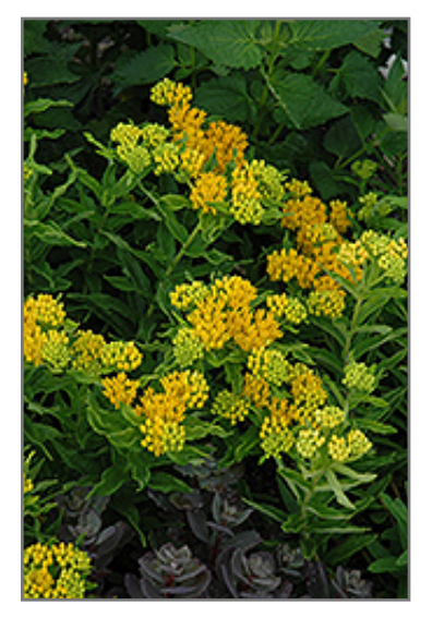
Hello Yellow Milkweed flowers