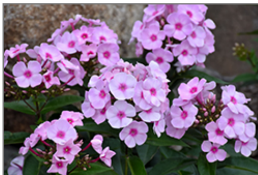
Cotton Candy Garden Phlox flowers