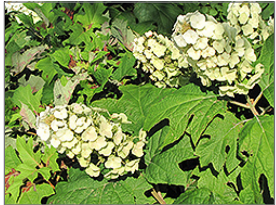
Snow Queen Hydrangea flowers

This shrub performs well in both full sun and full shade. It prefers to grow in average to moist conditions, and shouldn't be allowed to dry out. It is not particular as to soil type or pH. It is somewhat tolerant of urban pollution, and will benefit from being planted in a relatively sheltered location. Consider applying a thick mulch around the root zone in winter to protect it in exposed locations or colder microclimates. This is a selection of a native North American species.