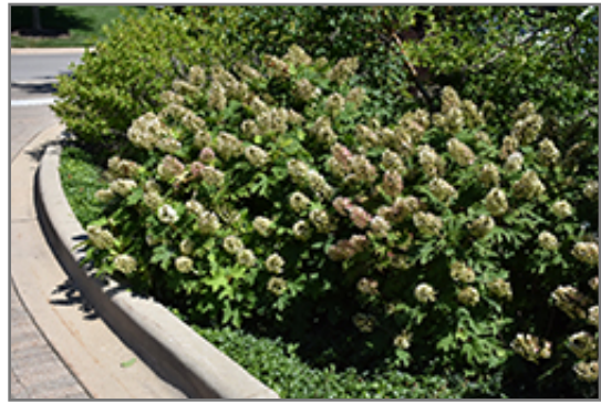
Snow Queen Hydrangea in bloom

Snow Queen Hydrangea is recommended for the following landscape applications;