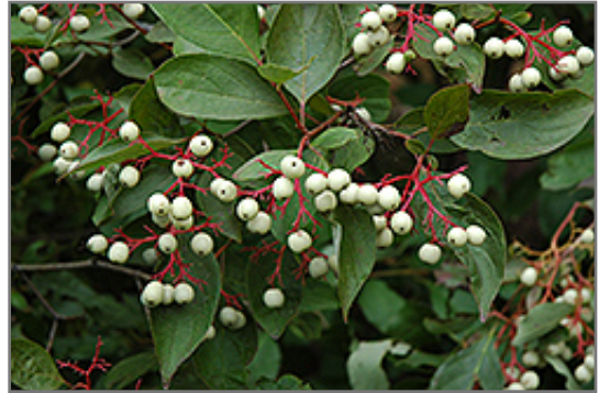
Gray Dogwood fruit