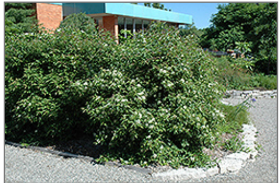
Gray Dogwood in bloom