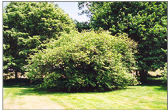
American Hazelnut

American Hazelnut will grow to be about 12 feet tall at maturity, with a spread of 8 feet. It tends to be a little leggy, with a typical clearance of 2 feet from the ground, and is suitable for planting under power lines. It grows at a medium rate, and under ideal conditions can be expected to live for approximately 30 years. While it is considered to be somewhat self-pollinating, it tends to set heavier quantities of fruit with a different variety of the same species growing nearby.