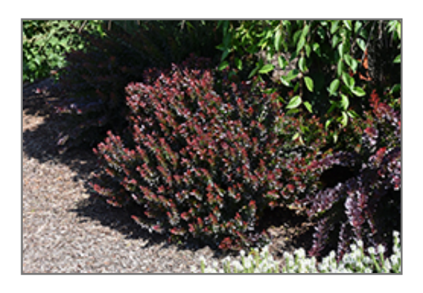
Midnight Ruby Barberry