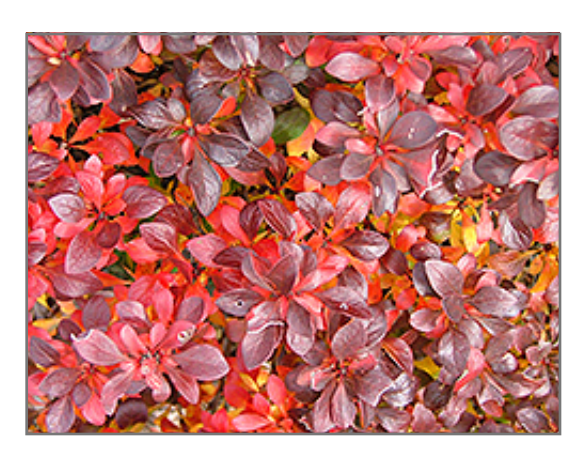
Midnight Ruby Barberry in fall