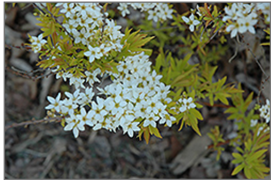
Mellow Yellow Spirea flowers