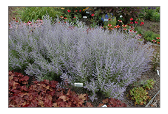
Peek-A-Blue Russian Sage in bloom

Peek-A-Blue Russian Sage is recommended for the following landscape applications;