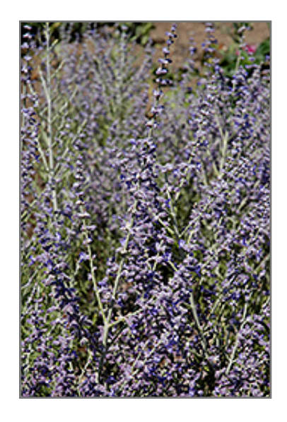
Peek-A-Blue Russian Sage flowers