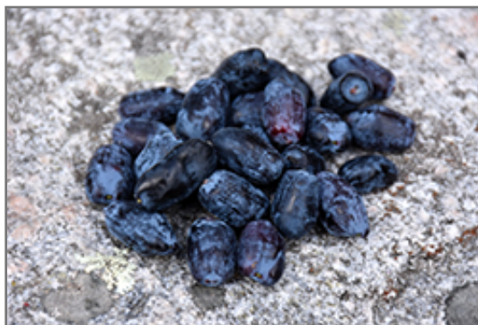
Indigo Gem Honeyberry fruit

This is a dense multi-stemmed deciduous shrub with a more or less rounded form. Its average texture blends into the landscape, but can be balanced by one or two finer or coarser trees or shrubs for an effective composition. This plant will require occasional maintenance and upkeep, and is best pruned in late winter once the threat of extreme cold has passed. It is a good choice for attracting butterflies to your yard. It has no significant negative characteristics.