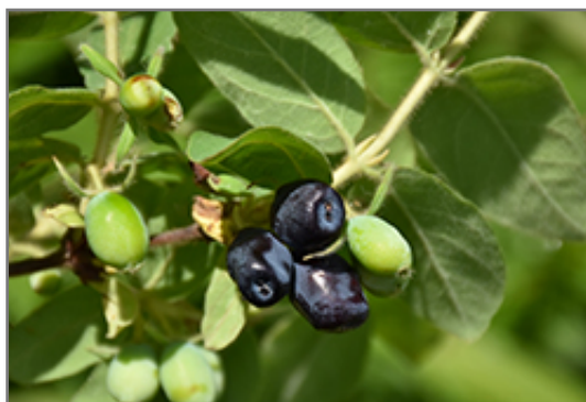
Indigo Gem Honeyberry fruit