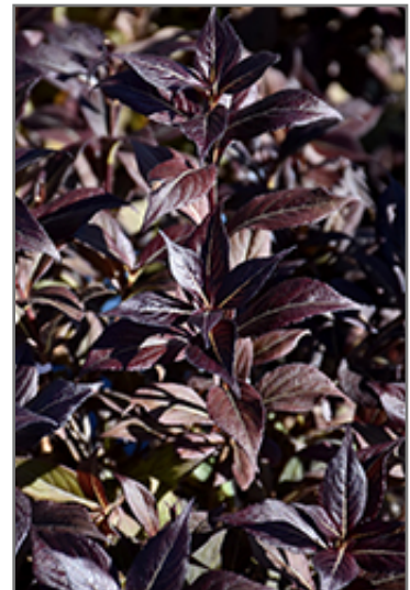
Date Night Stunner Weigela foliage