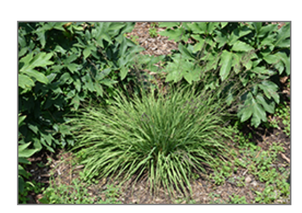
Poul Petersen Moor Grass