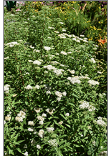
Meadowsweet flowers