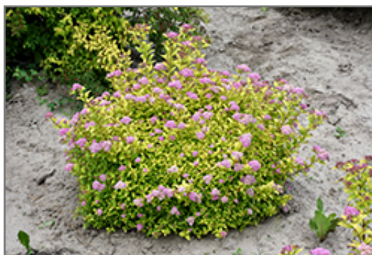
Sundrop Spirea in bloom