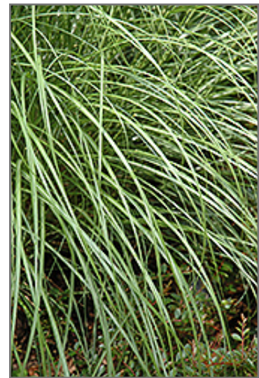
Little Kitten Dwarf Maiden Grass foliage